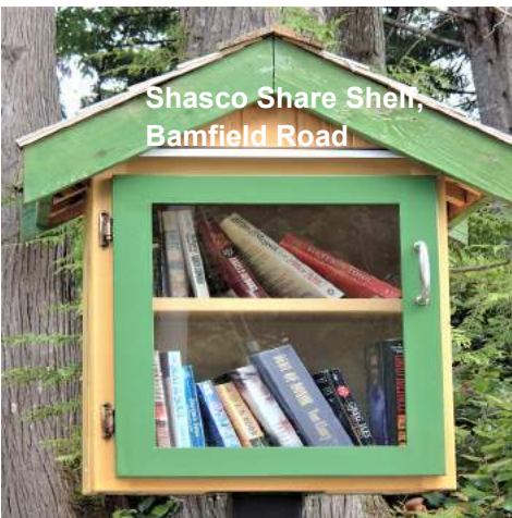
Shasco Share Shell, Bamfield Road