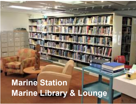
Marine Station Marine Library & Lounge