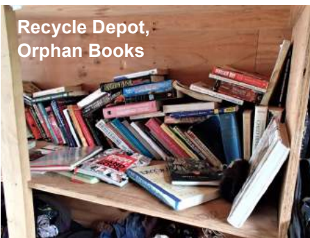
Recycle Depot, Orphan Books