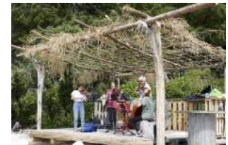
Brady Beach COVID, 2021