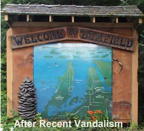
After Recent Vandalism